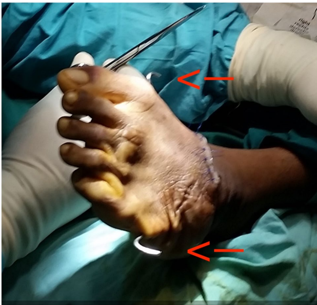
Photos. 15-17 Intra-operative results of triple arthrodesis showing position of dorsal incision and the 2 crossing k-wires (red arrows)

Previous studies in LMICs have shown comparable results for the outcome after PMR surgery [12, 27, 28]. Faldini et al. have followed two cohorts in Eritrea (2- to 5-year-old) and Tanzania (6- to 9-year-old) who underwent