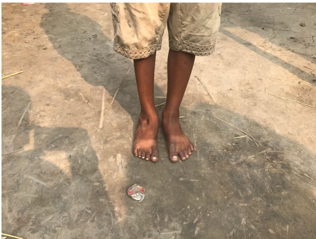
Photos. 1-3 Two-year post-operative status after right PMR with TATT in 5-year-old boy

CTEV: congenital talipes equinovarus PMR: Posteromedial release NWB: non-weight bearing WB: weight bearing