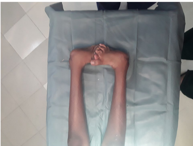
Photos. 4-9 Pre-operative and 2-year post-operative status after bilateral PMR with cuboid osteotomy in a 9-year-old boy

For the statistical analysis, patients were divided into three groups: group 1 received a PMR with or without tibi-alis anterior tendon transfer (TATT) but without additional bony procedures, group 2 received a PMR with at least one