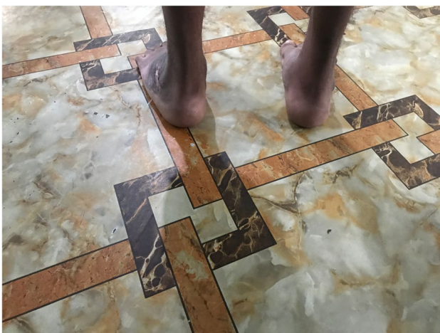
Photos. 10-14 Pre-operative and 2-year post-operative status after bilateral triple arthrodesis in a 21-year-old man

The modified ICFSG score could only be compared for the three month follow-up visit, and only between group 1 and 2. The difference is not statistically significant.